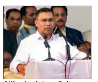
BNP acting chairman Tarique Rahman addresses supporters in Dhaka on Thursday, Dec. 25

He, however, underlined that the law allows any eligible citizen to be included in the voter list at any time.