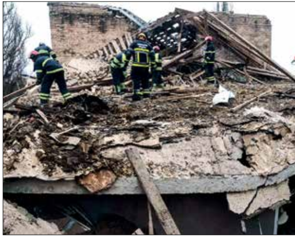
Rescue workers clear rubble at the roof of an apartment building damaged after a Russian strike on Kyiv on Saturday

The ministry said the strike came in response to Ukraine's