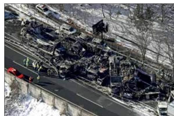
Burnt vehicles are seen after a massive crash on an expressway, in Minakami

A fire erupted at the far end of the pileup, spreading to 20 vehicles, some of which