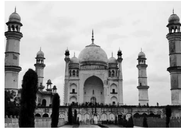
Bibi ka Maqbara, also known as the Taj of the Deccan, was constructed by Mughal emperor Aurangzeb in memory of his wife in the 17th century

The Maqbara, also known as the Taj of the Deccan, was constructed by Mughal emperor Aurangzeb in memory of his wife in the 17th century. The monument attracts the highest footfall of tourists in the city. The monument is based on the Chaharbagh pattern, and the mausoleum at its centre has four towers in the first two 22-metre-tall minarets will be taken for conservation, the official said, adding that the work will continue for nearly one year. This pattern is a Persian and Islamic quadrilateral garden layout featuring a